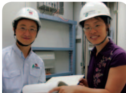
With engineers, suppliers and plant staff working together Dujiangyan has become a very reliable plant

By investing in its customers’ processes and methodology, Schneider Electric is now in a position to easily implement a new cement plant in any country, with the same level of performance and reliability and at an optimised cost. _____ |