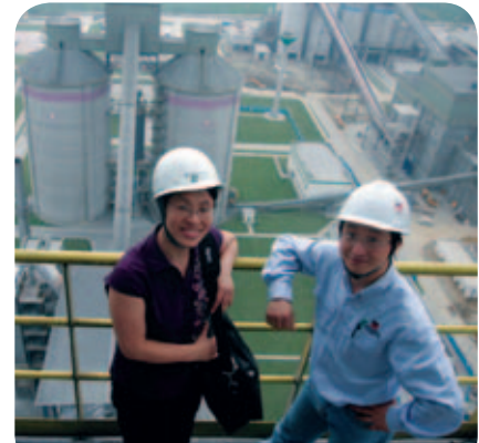
Job done at Dujiangyan Cement plant

Besides this new project, Schneider Electric and Lafarge were able to take advantage of this success on several others projects, including the grinding plant and cement terminal at Lafarge