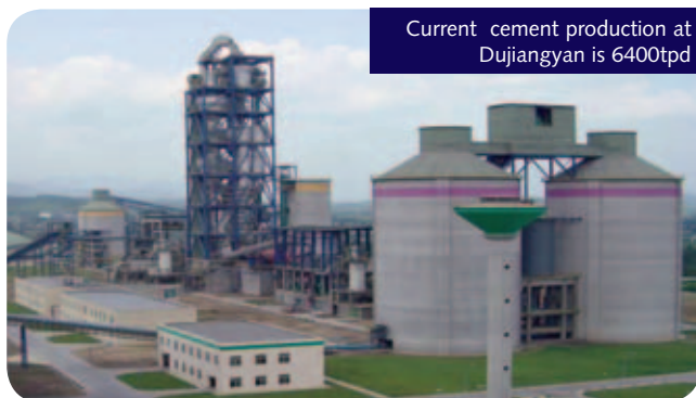
Current cement production at Dujiangyan is 6400tpd