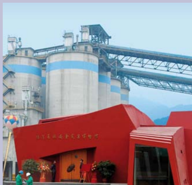
Designed by architect Qian Fang, the Lafarge Shui On Jin Feng museum houses a remarkable archeological treasure dating from the Song Dynasty, which teaches us about techniques employed to manufacture ceramics 800 years ago.

After six months of further excavations, it was decided to construct a museum on the plant’s grounds. Lafarge called on Qian Fang, a renowned Chinese architect who had previously designed several museums in China. The building’s red silhouette evokes a dragon, and resembles the shape of one of the ancient kilns.